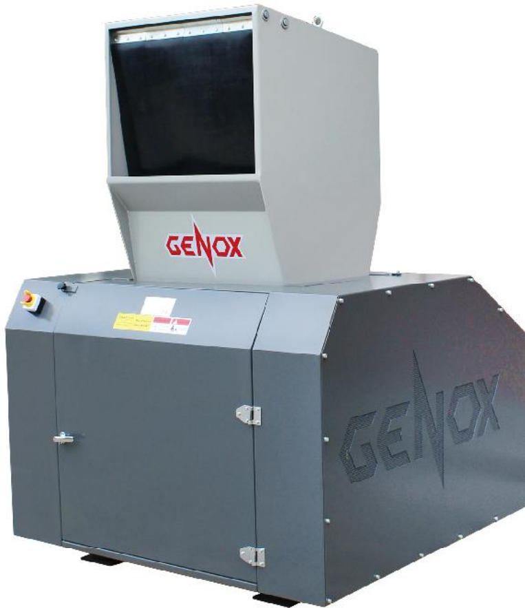
GC Granulator with Sound Proof Enclosure

GC Series Granulators are high speed granulation machines designed especially for the efficient size reduction of various materials in a single pass. These machines are ideal for processing a multitude of materials including plastics, rubber, fibres, copper cable and light non-ferrous metals amongst others.