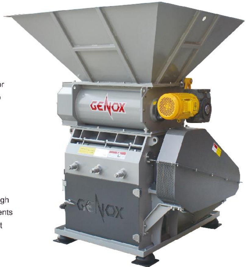
GC Granulator with Bottle Feeder