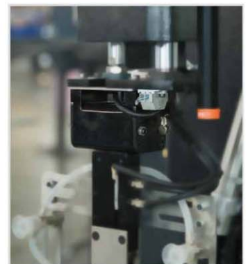
Claw rotating group