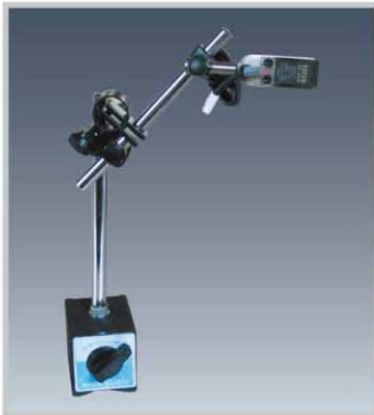
Middle Mold Detector